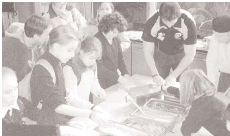
Children from various schools making healthy pizzas at the Cornwall Healthy Schools Conference at the Eden Project in November.

The Annual Healthy Schools Conference was held at the Eden Project on 8 November. This year the event focussed on giving young people (and adults!) an opportunity to try something new. See page two for further information on this very special day!