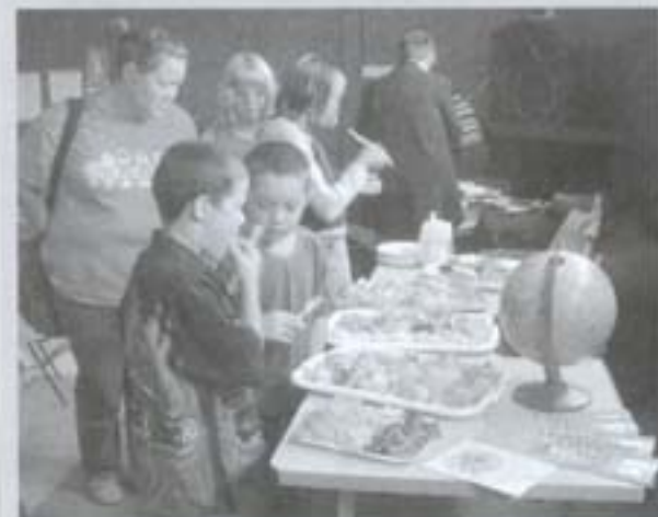
Here are some of the attendees enjoying fruit and vegetables from around the world.

The Healthy Living Initiative was delighted to award the Falmouth Youth Club £295 to help with the costs of a healthy living day as part of the Sunburst Community Activity Days programme. The day involved stalls, information and food all available to encourage and promote all things healthy!